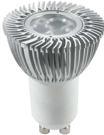
dimension \Phi 50 \times 60 \text{mm}